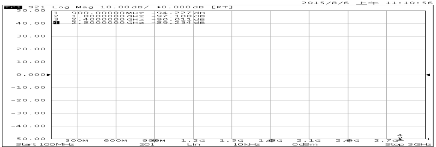
Channel 1 - Insertion Loss

Mark1 : -0.0097 @ 900.0000MHz Mark3 : -0.0036 @ 2400.0000MHz